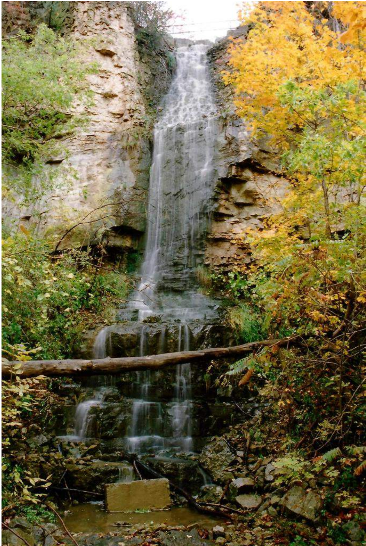
The GREEN Waterfall of the Month for November 2015 is Lafarge Falls.