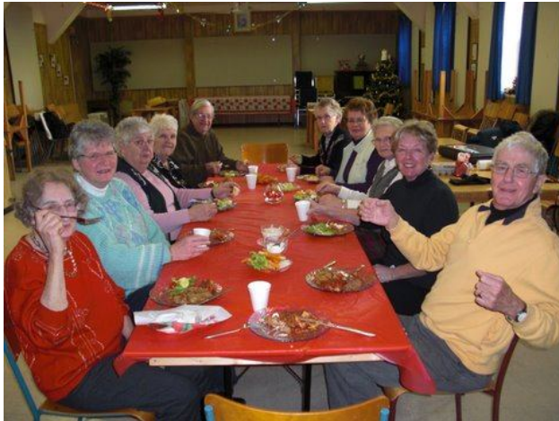
The Westover Group at their Christmas party last year.

The Westover Artists Group are pleased to be a part of this year's Giant Rib Discovery Centre Exhibition at the Dundas Valley Trail Centre.