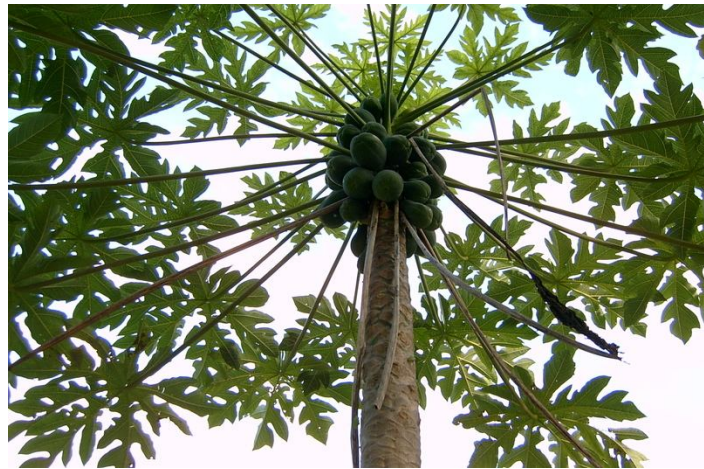
Pawpaw Tree with Fruit